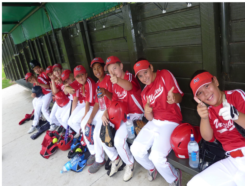
Grassroots to High Performance